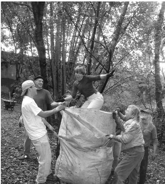
Compressing bagged-up ivy at Live Oak Park, Berkeley