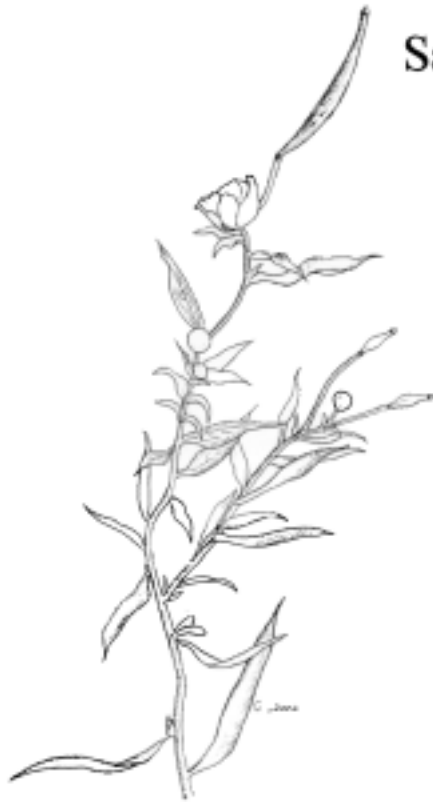
Denbromecon rigida

Regional Parks Botanic Garden Tilden Regional Park, Berkeley