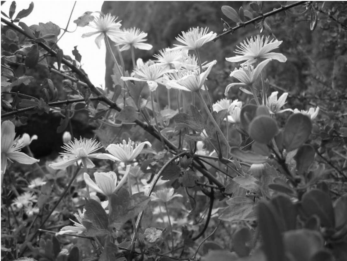
Clematis lasiantha, Pinnacles National Monument.

California Native Plant Society East Bay Chapter P.O. Box 5597, Elmwood Station Berkeley CA 94705