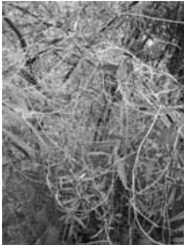
Japanese dodder attacking willow tree.

A new pest parasite, Cuscuta japonica or Japanese dodder, has been found invading the East Bay. Please be on the lookout and inform your county agriculture office if you see it.