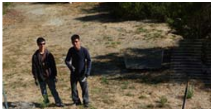
of people setting up for the plant fair: cleaning seeds, preparing the drive, and watering.