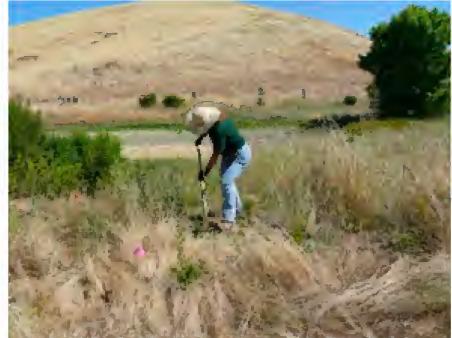
Weeding around the roses at Bayberry Pond