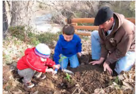
Planting a blue elderberry at Marsh Creek