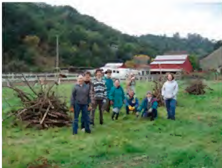
Strenzel Meadow crew

Officers and Committee Chairs serve on the Board.