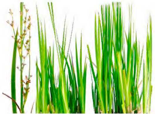
Juncus xiphioides , the iris-leaved rush.

Please send your check today to the "East Bay Conservation Analyst" and send the check to: