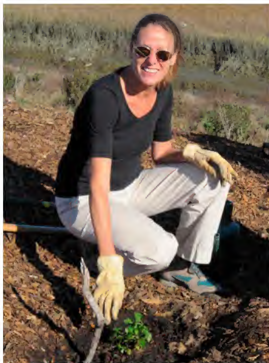
A volunteer plants a Bee Plant ( Scrophularia californica ) at Point Isabel.

An eight person volunteer crew took extra care while planting at Pt. Isabel in windy conditions on December 3rd. We had to ensure the ground was properly prepared and ready for planting the moment we exposed the roots to the air. Working quickly, and hanging onto our hats, we planted seven bee plants ( Scrophularia californica ) four purple needle grass ( Nassella pulchra ), three sage brush ( Artemisia californica ), one quail bush ( Atriplex lentiformis ), and a California-fuchsia ( Epilobium canum ). Volunteers also removed radish sprouts and the ever emerging oxalis on the lower bank while the upper bank remains free of weeds thanks to the mulch that we