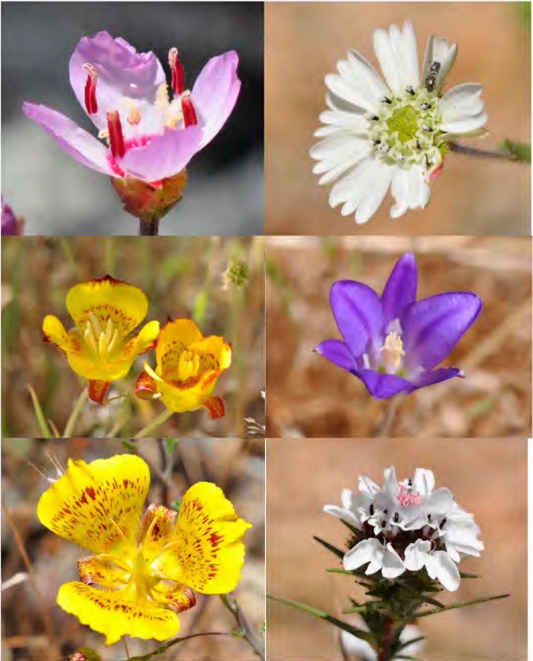
Photos of flowers at the Serpentine Prairie in Redwood Regional Park. The Conservation Committee of EBCNPS has played an important role in preserving the Prairie. Note the Presidio clarkia ( Clarkia Francisana) (top left), hayfield tarweed ( Hemizonia congesta ssp. luzufolia) (top right) the Calochortus luteus (middle left), a Brodiaea, middle right, another C. luteus, lower left. and an unidentified white flower, lower right.