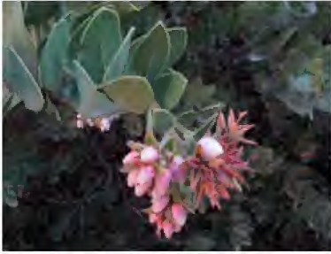
Mt. Diablo manzanita Arctostaphylos auriculata