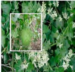
Marah fabaceus .

For March our half-price special is on Marah ( M. fabaceus and M. oreganus ) sometimes called wild cucumber or man-root, which is a deciduous vine. It emerges in winter and leafs out in spring, producing bright green leaves, white flowers, and round, spiny fruits. It climbs through and over other plants, fences, and anything else in its path, growing fast, but shrivels and dries out in summer. They are available in one-gallon containers. One of the common names, man-root, was given because the underground tubers get very large, sometimes up to six feet across.