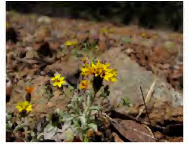
Spring Lessingia Lessingia tenuis