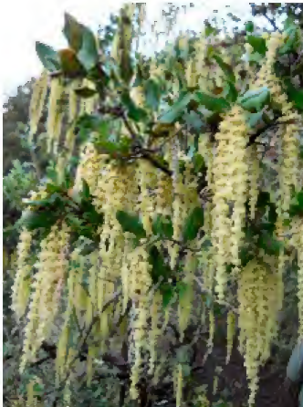
Coast silk tassel ( Garrya elliptica), Huckleberry Regional Botanical Preserve.