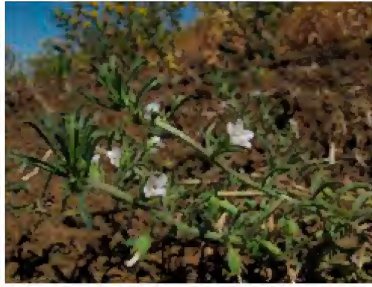
Small-flowered morning glory Convolvulus similans