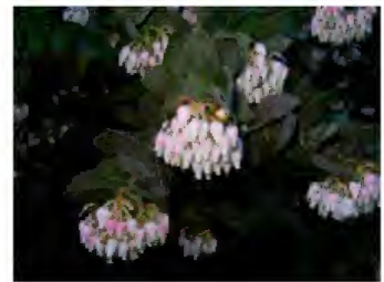
Pallid manzanita ( Arctostaphylos pallida), Huckleberry Regional Botanical Preserve. A. pallida is a rare species.