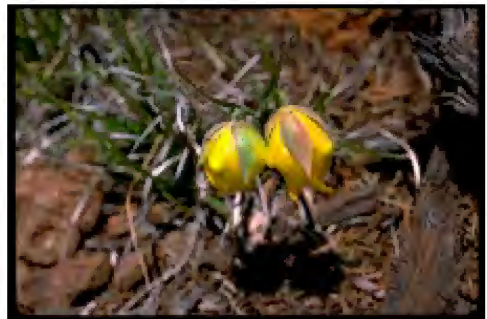
Calochortus raichei.