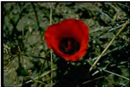
Calochortus kennedyi.

We will contact you when the meeting date is closer to confirm commitments.