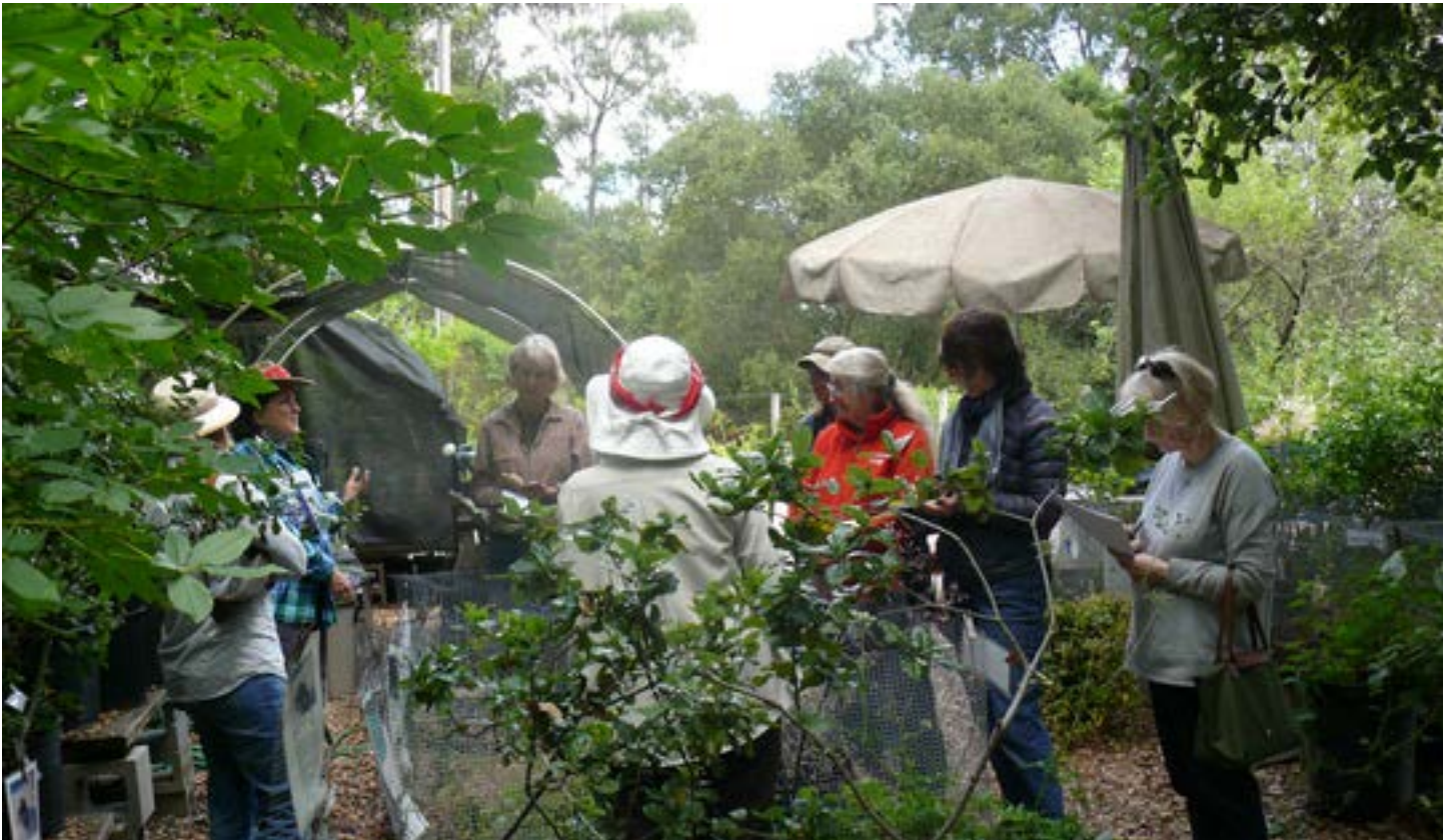
Docent training at Native Here Nursery