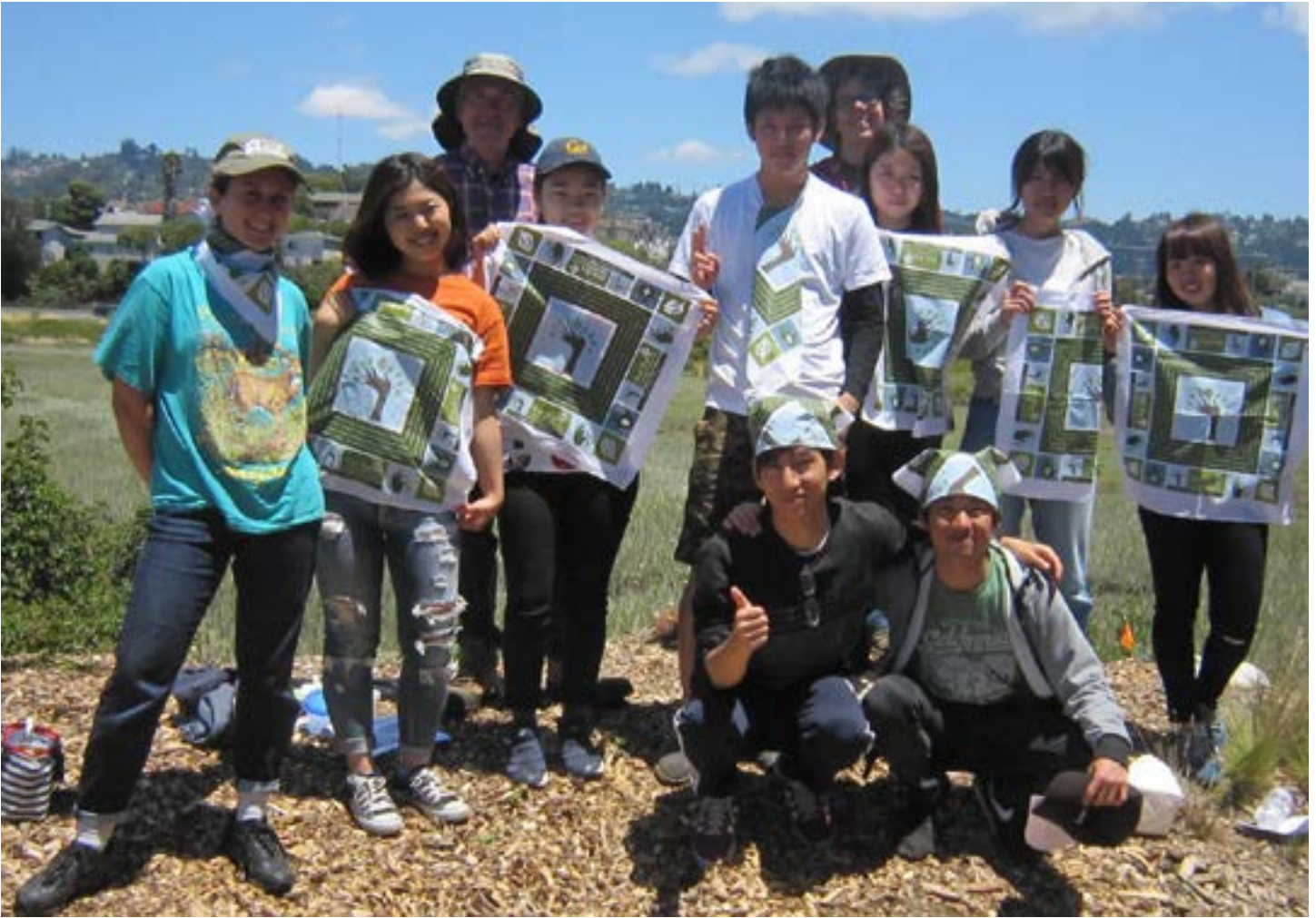
ESI students at the end of the day (above), photo by Jane Kelly. Skunk at Point Isabel, photo by Lewis Payne (left below). Great blue heron at Point Isabel, photo by Jane Kelly (right below).