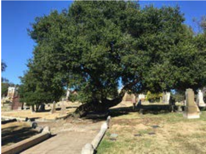
A coast live oak at Mountain View Cemetery.