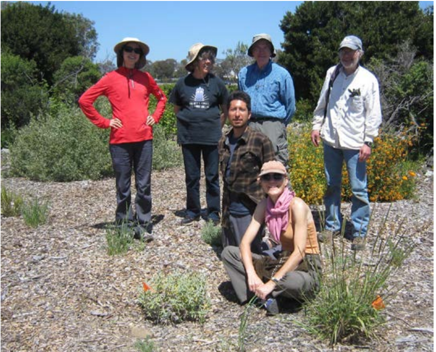
Above, the April crew; below left, California poppy; below right, Allium unifolium.