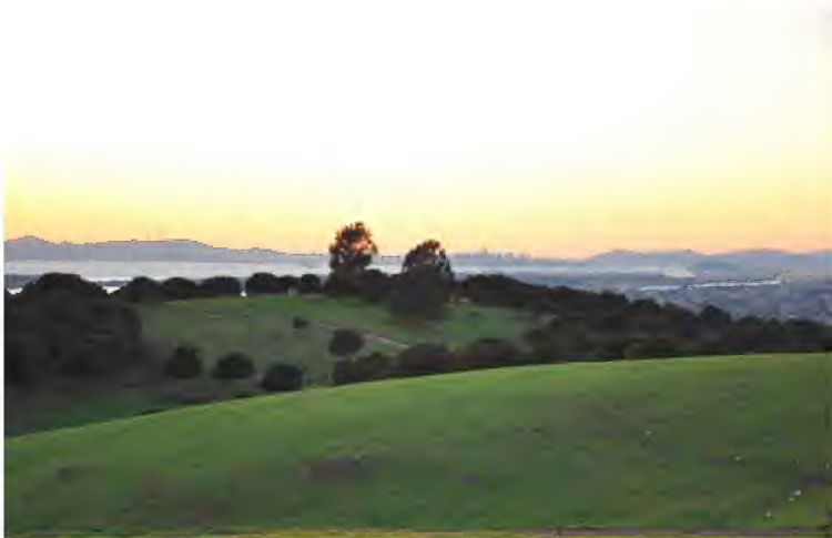
Dusk at Knowland Park. Note the giant fairy ring in the grassland on the first knoll (a strip of dark green with white puffballs dotting it).