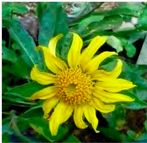
Mt. Diablo sunflower ( Helianthella castanea )