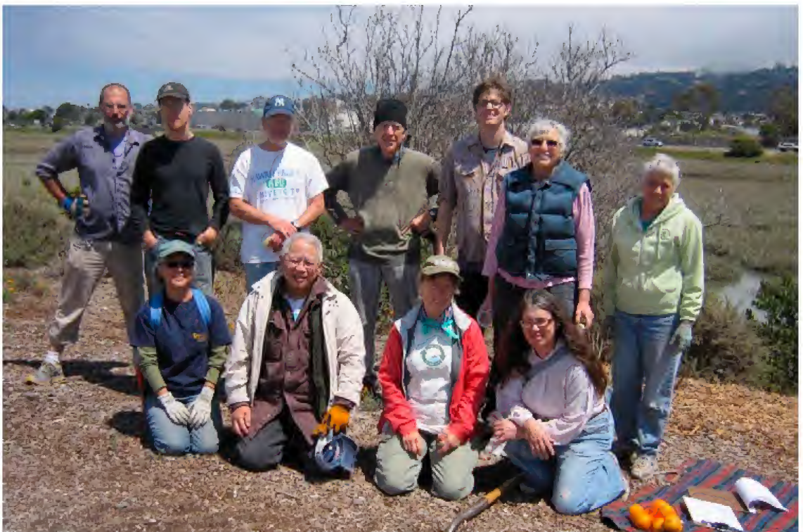
Photo of August crew