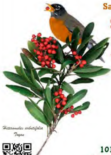
Heteromeles arbutifolia Toyon