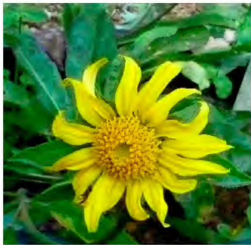
Mt. Diablo sunflower ( Helianthella castanea )