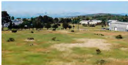
Bird's eye view of the native coastal prairie grassland that EBCNPS is working to protect at the Richmond Field Station.

At the end of last week I was contacted by an environmental ally regarding a General Plan Revision effort being undertaken by the City of Newark. Among the proposed changes to the general plan are land-use changes that pave the way for the development of an 18-hole golf course and nearly 500 houses on 550 acres of historic baylands. The area in question, referred to as "area 4" overlaps a section of our Warm Springs BPPA.