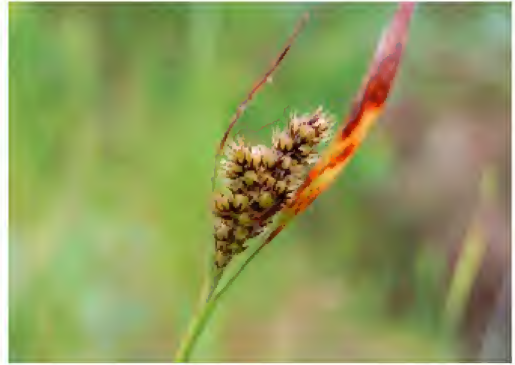
Wood rush ( Luzula comosa )