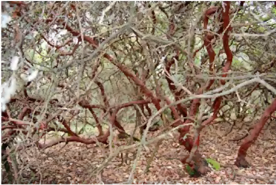
Brittleleaf manzanita ( Arctostaphylos crustacea ) and chamise ( Adenostoma fasciculatum ) entangled