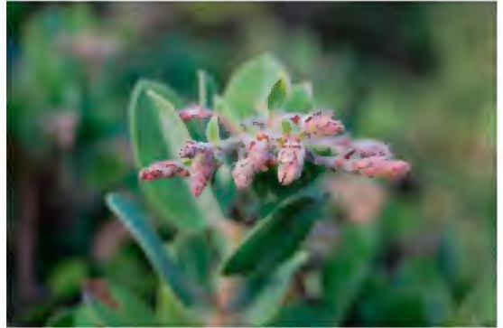
Nascent inflorescences of brittleleaf manzanita ( Arctostaphylos crustacea )