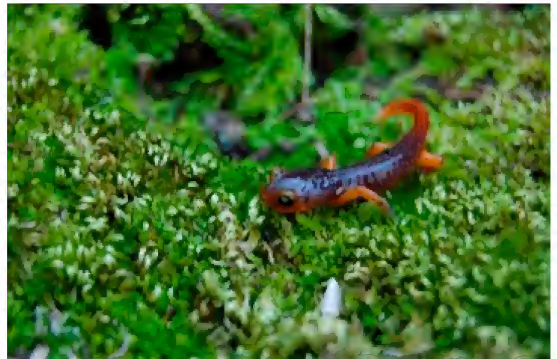
Yellow-eyed salamander ( Ensatina eschscholtzii xanthoptica ) on moss (sp. unknown)

Knowland Park photos on pages 3 and 4 by Laura Baker