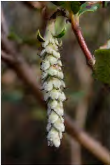
Female catkin of coast silk tassel ( Garrya elliptica )