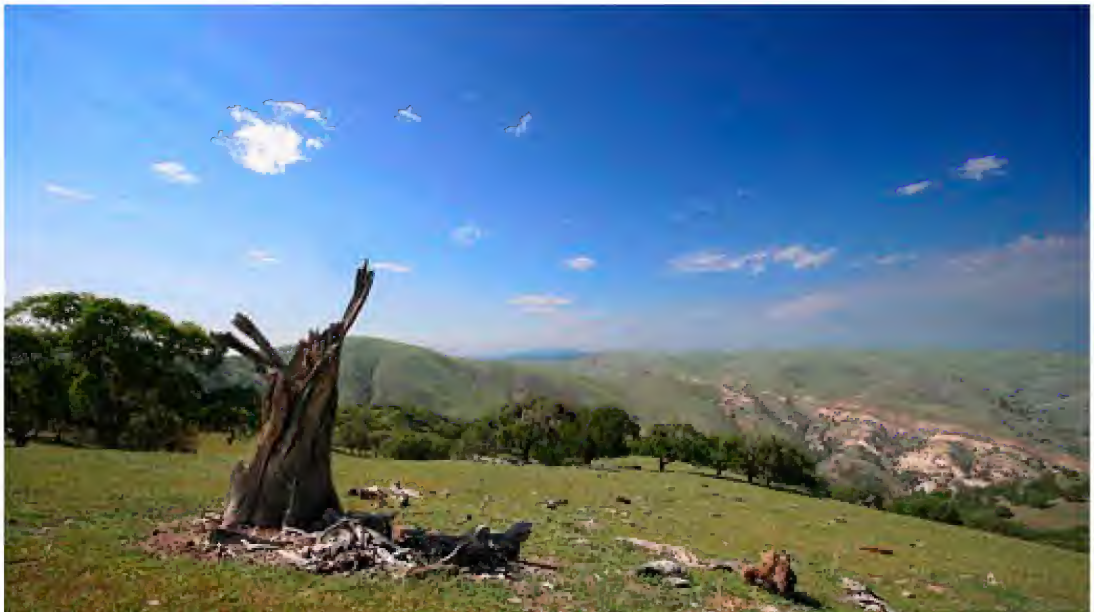
Tesla Property.