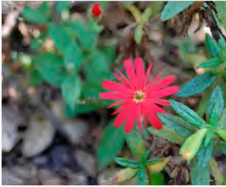
Indian pink ( Silene laciniata ssp. californica ) growing among sticky yellow monkeyflower ( Diplacus aurantiacus )